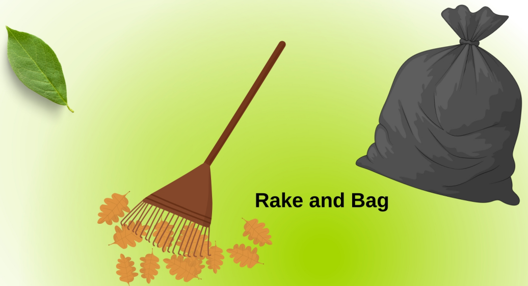
Rake and Bag

Leaves clog storm drains which can cause flooding during rain events. Leaves can rot inside of storm drains and cause algae blooms that harm aquatic life.